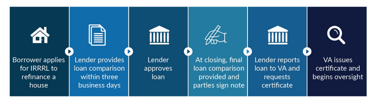
Figure 2. IRRRL application and guaranty process.

Figure 2 provides an overview of the IRRRL process from application through guaranty.