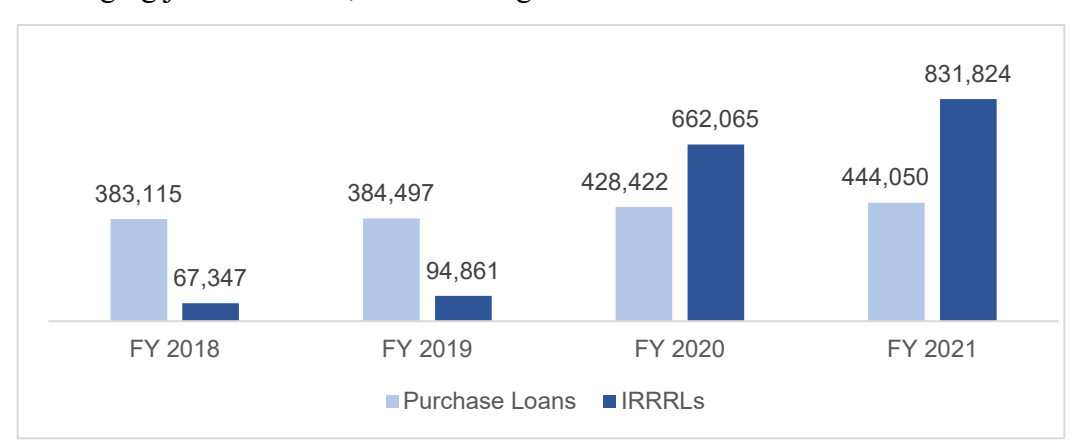
Figure 1. Increase in the number of IRRRLs from FY 2018 to FY 2021.

In fiscal year (FY) 2020, VA reported a 598 percent increase in the number of IRRRLs from the previous year—from 94,861 to 662,065. The steep increase is attributable to lower interest rates starting in the last quarter of calendar year FY 2018, which continued through 2020. For FY 2020, VA reported just over 662,000 IRRRLs at an overall value of about $199 billion for that fiscal year, with individual IRRRLs averaging about $300,500. For FY 2021, VA reported just under 832,000 IRRRLs, amounting to an overall value of about $243 billion, with individual IRRRLs averaging just over $292,000. See figure 1 for recent trends.