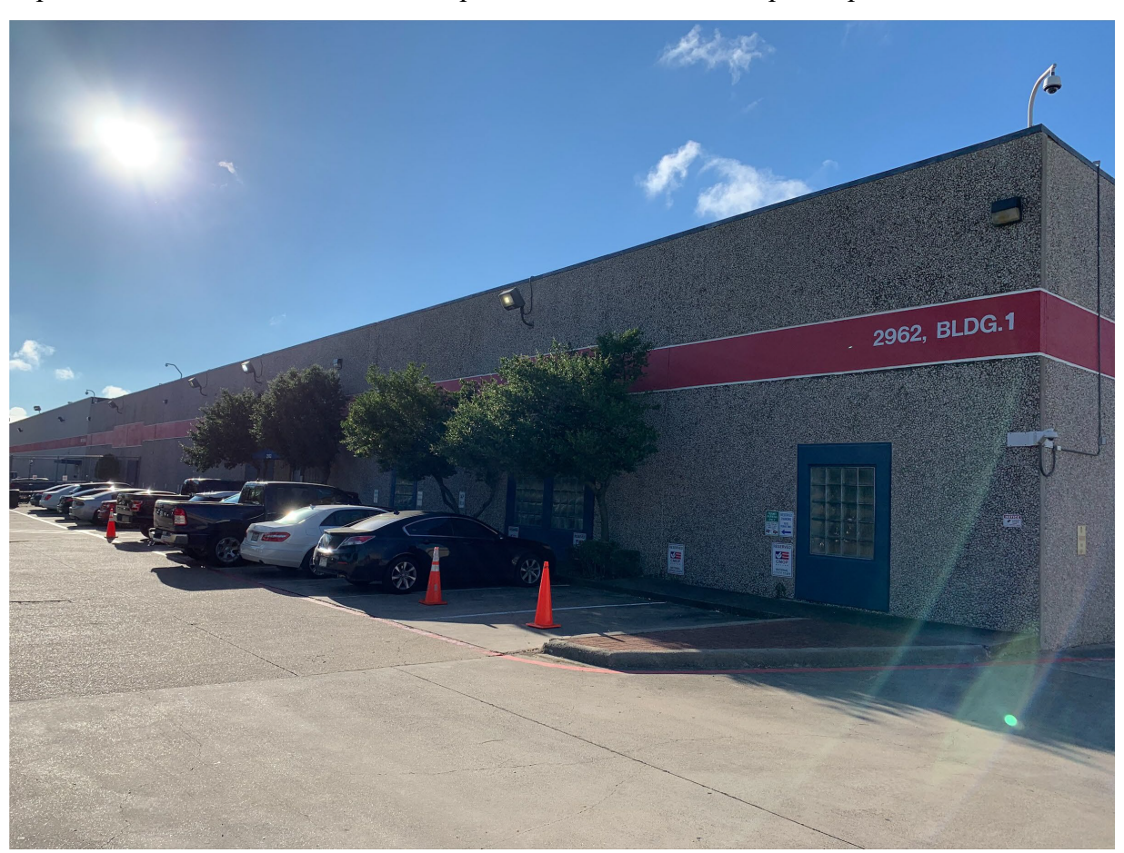
Figure 2. Dallas Consolidated Mail Order Pharmacy. Source: VA OIG inspection team, September 15, 2021.

The Dallas CMOP facility is about 90,000 square feet and services VA medical sites in Arizona, Arkansas, Louisiana, Mississippi, Oklahoma, and Texas. The CMOP's projected FY 2021 expenses are over $768 million, and it processed over 19 million prescriptions in FY 2020.