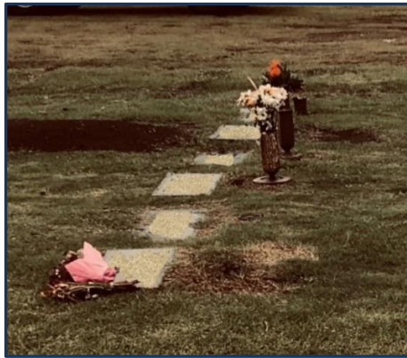
Figure 4. Newly installed flat markers that were misaligned in Makawao, Hawaii.

At Makawao, in February 2020, the team observed that many flat markers in a new section with 69 gravesite markers were not properly installed and needed to be reset and realigned with support bases. One of those gravesites was in the team's sample of 75 gravesites. The Maui veterans cemetery supervisor explained he was experimenting with a new concrete-setting practice for flat markers and did not think compacting (tamping) the ground was necessary, although it was noted as an issue during the 2015 compliance review and is required by NCA standards. Figure 4 shows newly installed, misaligned brass flat markers at Makawao that were not installed according to NCA's required installation procedures.