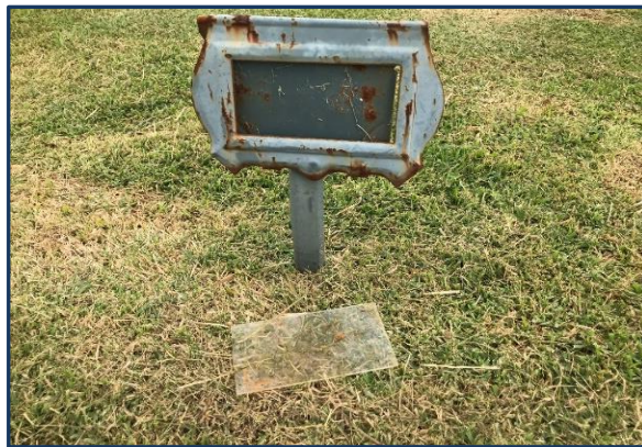
Figure 3. Gravesite unmarked for 19 years in Hilo, Hawaii.

At Hilo, the OIG team identified timeliness issues at an additional 42 gravesites that were not part of the sample, such as the gravesite of a veteran's spouse that had been unmarked (temporary marker only) for 19 years (figure 3). The team observed seven gravesites that had been unmarked for between two and 19 years. Included in the observed seven gravesites were two veteran gravesites with temporary markers for approximately 12 and 13 years, and one gravesite for a veteran's spouse with a temporary marker for about five years.