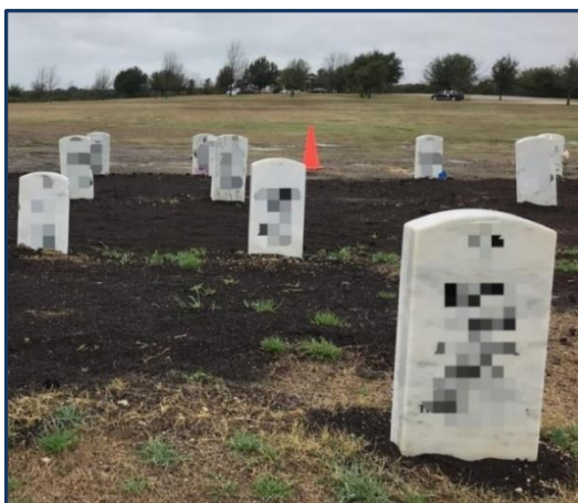
Figure 2. Newly installed misaligned and sunken headstones in Killeen, Texas.

Veteran information removed for privacy reasons.