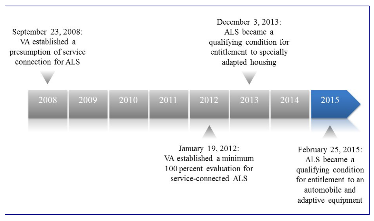
Figure 1. ALS Regulatory Changes Timeline

Figure 1 illustrates the timeline of regulatory changes involving ALS as VA recognized the rapid progression and severity of the disease and added entitlement to additional benefits.