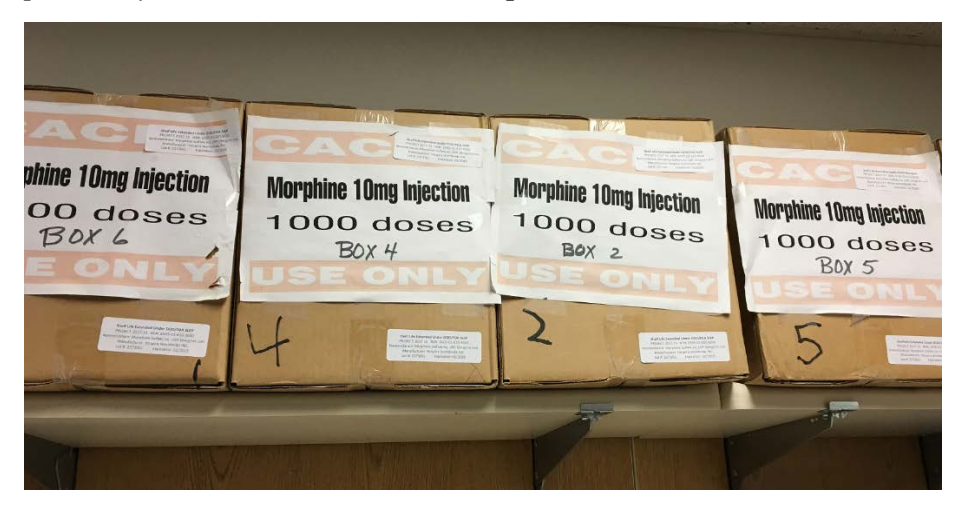
Figure 2. Morphine incorrectly stored in the pharmacy vault at an emergency cache.

A facility stored its emergency cache supply of morphine on open shelves in its pharmacy vault, rather than in the required sealed totes.