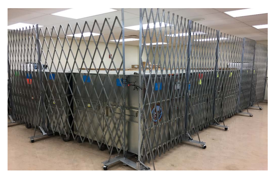
Figure 4. Emergency cache storage location at an emergency cache.

After the team conducted preliminary interviews with EPS, OEM, and OPH officials in November 2017, program officials reconvened the Emergency Cache Program Review Committee.